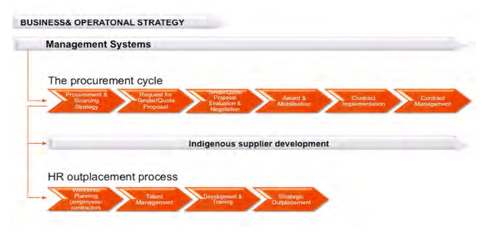
Figure 1. HR Support for Indigenous Supplier Development

procurement, with the commitment and engagement of Procurement teams a critical element.